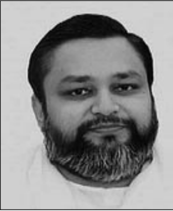
His Excellency Dr Girish Varma

His Excellency Dr Girish Varma, Minister of Higher Education of the Global Country of World Peace, announced last month that experts had visited the 4,000 villages and district towns around India in which the Yogic Flying Vedic Pandits are being trained, and had selected 16,000 to form the first two groups of 8,000 in the centre and the west of India. It is hoped that construction of accommodation for these two groups will be