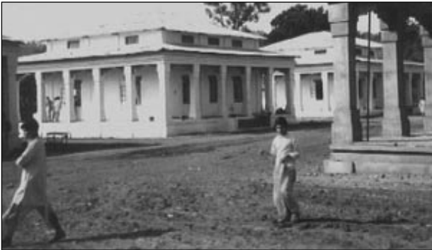
▲ Recently constructed Vedic mandaps for the performance of Maharishi's Vedic Technologies of Peace

“In Britain, we have a very special responsibility to support the groups of 8,000 Vedic Pandits in every way we can. Britain continues to play a leading role in conflicts around the world, often being alongside the USA in policies of aggression and bombing. Every day in the news we are reminded of the urgent need for a more positive and coherent national consciousness, and the need for our country to have a more positive influence in the world. According to the principle ‘As you sow, so shall you reap,’ our donations to this project will help turn the tide of negativity and bring benefit to the individual donor, to Britain, and to the world. Here is our opportunity to make Britain truly worthy of being part of Maharishi’s Global Country of World Peace.”